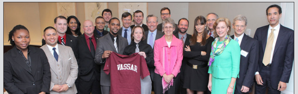
The first Vassar Veterans Posse with representatives from Infor, Moody’s, Posse and Vassar.

In January, at an awards ceremony in New York City hosted by Moody’s Corporation, The Posse Foundation and Vassar College recognized 11 veterans of the U.S. Armed Forces as members of the first Veterans Posse.