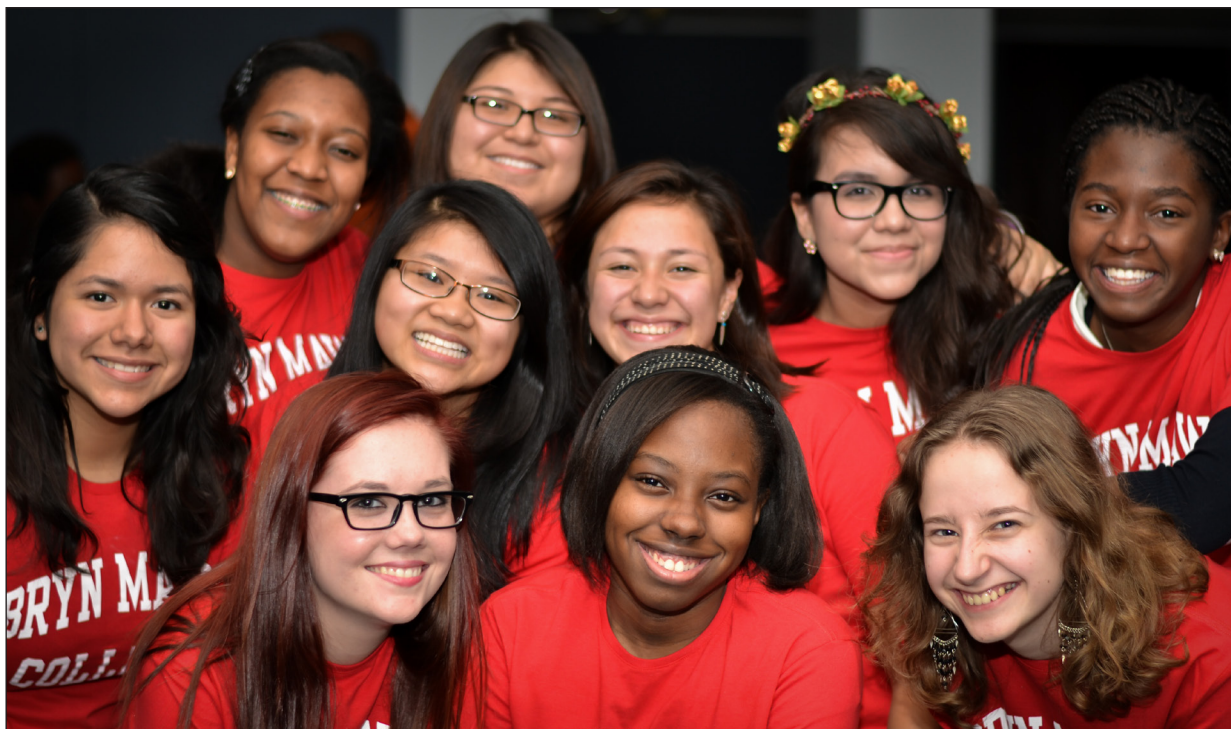
Houston's first Bryn Mawr Posse.

To date, Posse has identified, recruited and trained more than 4,800 Scholars who have collectively won $577 million in merit-based scholarships from the nation's top colleges and universities. *