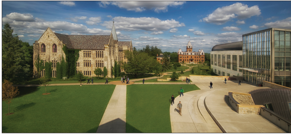
St. Olaf College in Northfield, Minnesota, will recruit Scholars from Posse Chicago.