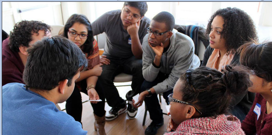
Students at the Brandeis PossePlus Retreat participate in a small group workshop about class.

Each year, Posse Scholars identify an important issue to explore with the larger campus community at a weekend retreat called the PossePlus Retreat (PPR). This year's PPRs entitled, "What's Your Worth?" challenged 3,500 participants at 37 Posse partner colleges and universities to discuss the topic of class, power and privilege in America.